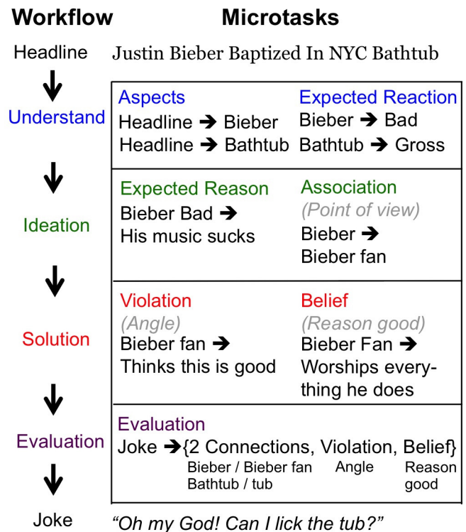
Figure 2: The four workflow stages and examples of the microtasks belonging to each stage.

The workflow we teach in HumorTools follows four design principles: Understanding the problem, Ideation, applying solution patterns, and evaluation. You typically progress through the design stages linearly, however, the decision to move between these stages is dynamic: once you understand the problem sufficiently, you can move to ideation. Once ideations have matured, solutions present themselves. After solutions are executed, they must be evaluated and iterated